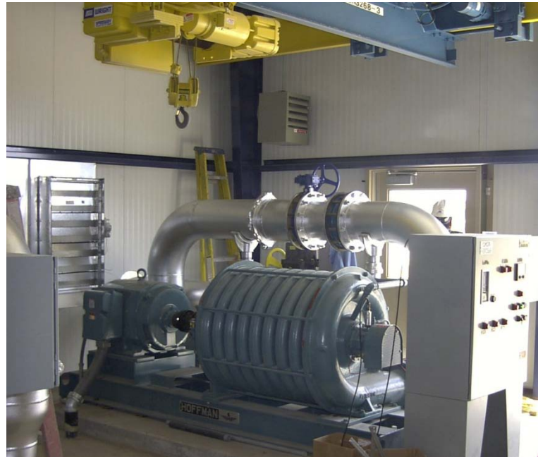
City of Gallup air blower