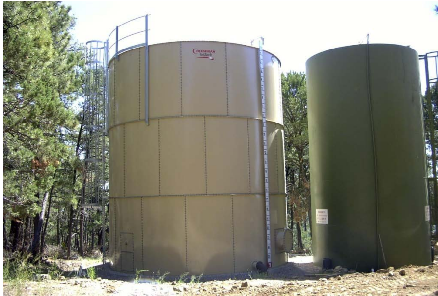
High Sierra water storage tank