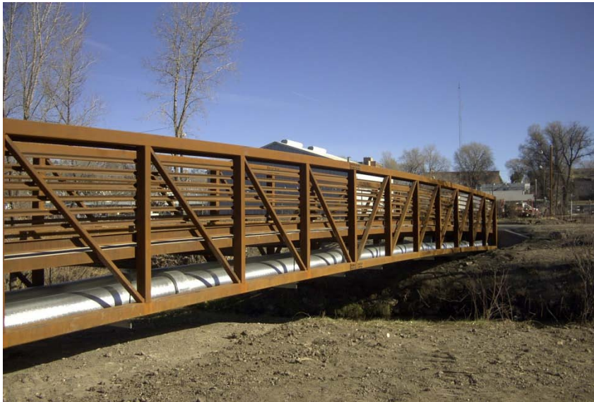
Las Vegas pedestrian bridge